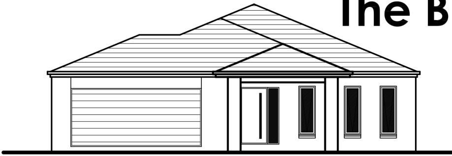
Facade Option 1